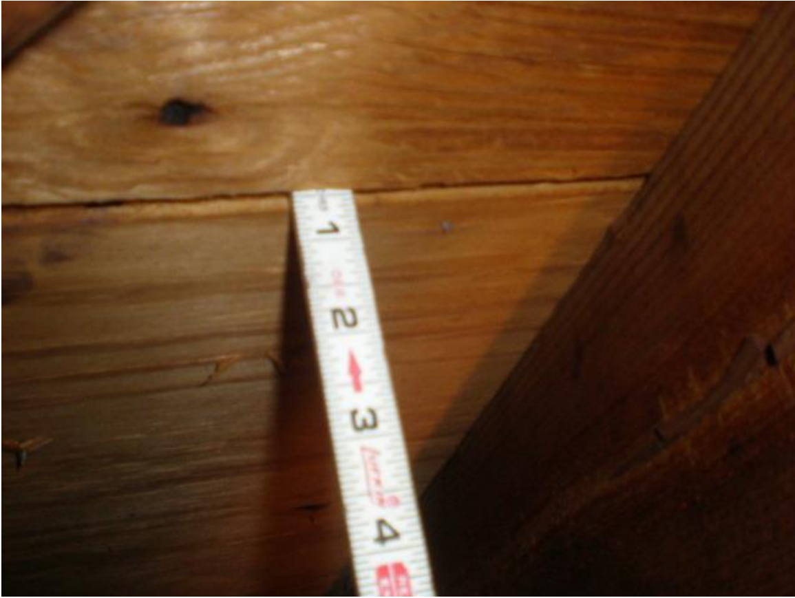
Roof deck staples