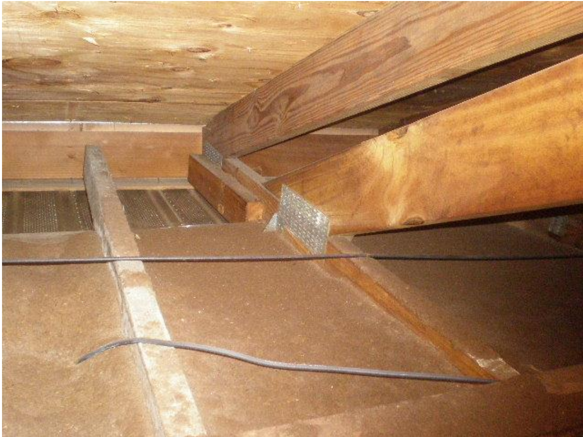
Roof to wall clips