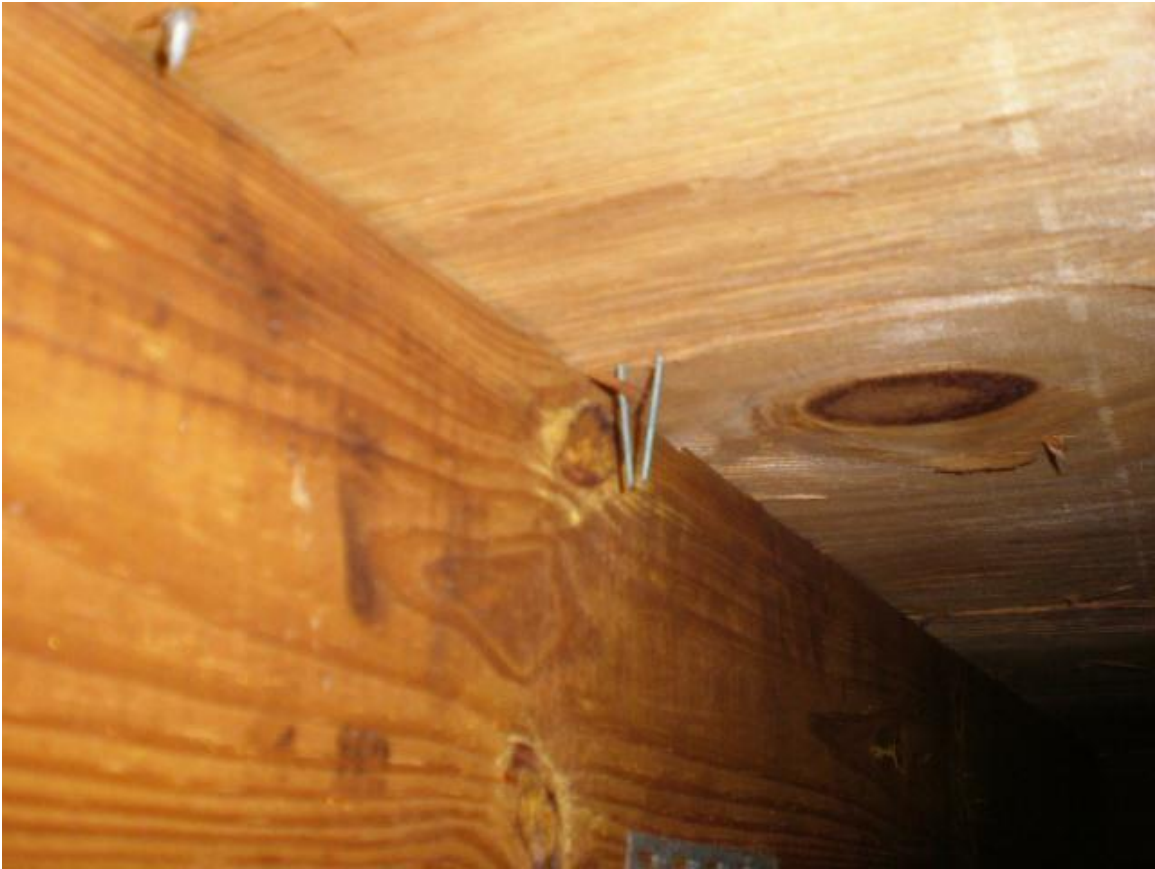
Roof deck staples