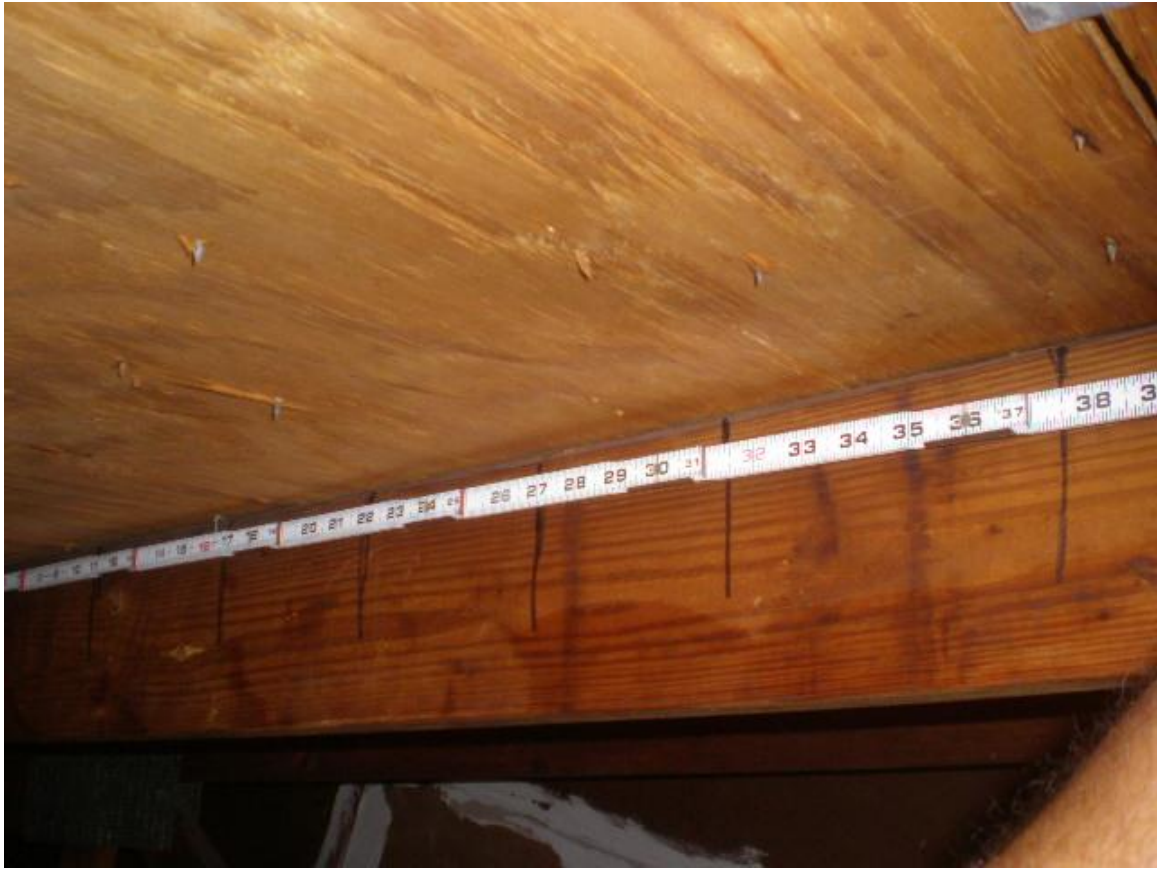
Roof deck staples